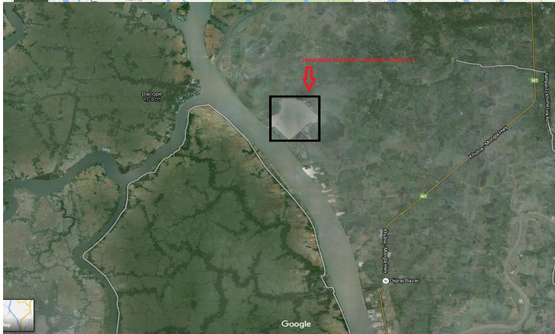
LOCATION MAP:2X660MW MAITREE RAMPAL PROJECT