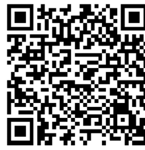
For online registration

For detailed questions or registration, please contact us at inquiries@mysteel.com .